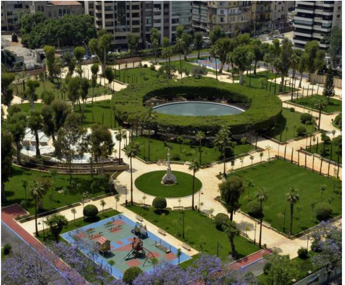
Sanayeh Garden, Beirut Lebanon