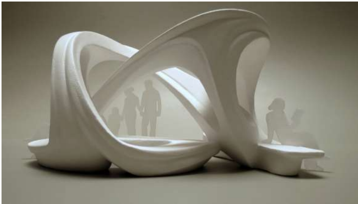
Nabil Helou - Public Art Sculpture 250 x 460 x 275 cm Fiberglass 2016 Unique piece - Courtesy of the artist.

In 2016, ART IN MOTION settles at the garden to make it its playground for creativity and invention, to let dreams flourish, and let all imaginations develop.