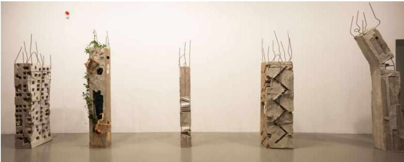
Marwan Rechmaoui - The Seven Pillars of Wisdom – 2016 - Concrete and mixed media

The selected international artists produce their works “in situ”, interacting with local artistic practices as well as locally sourced materials from the region.