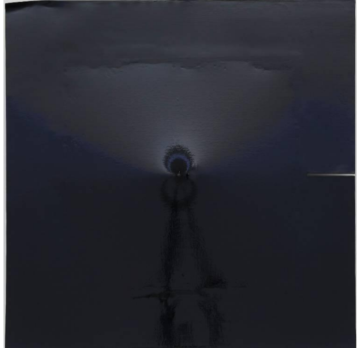
J YOUNG (South Korea) Moment, black punched metal panels

From March 30 to April 2, 2017, Mo.J Gallery is participating for the first time in ART PARIS ART FAIR with a stand dedicated to J Young. Its artworks are put in resonance with Houston Maludi' canvas which create a special connexion between the artistic scene from Korea and Congo.