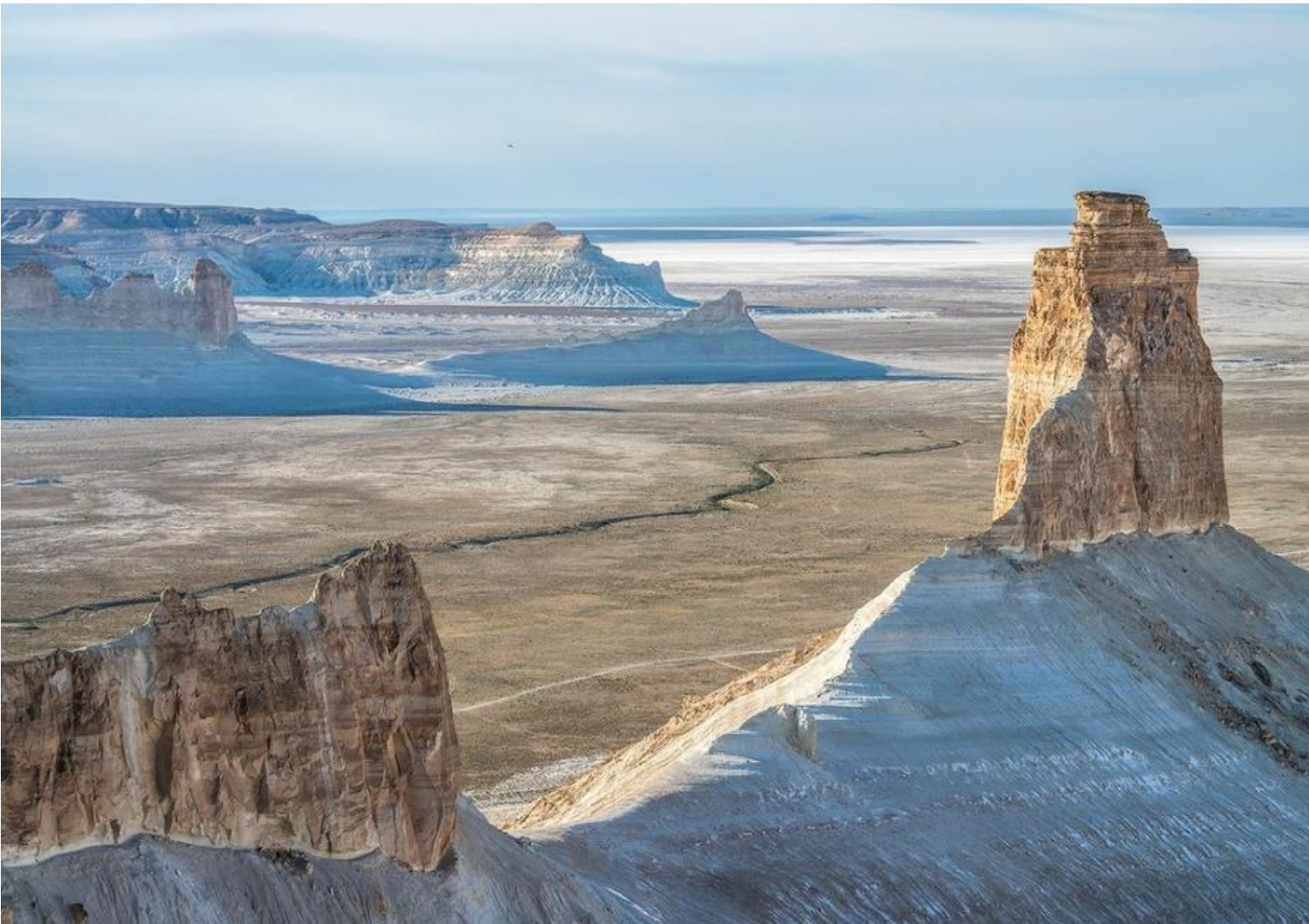
Mangystau, region landscapes

Within the project, the group of European and Kazakh artists will present the results of their artistic researches about the sacred places in Mangystau region, where ancient necropolises show the evolution of art and architecture and reflect the life of nomadic tribes in Central Asia for over a millennium.